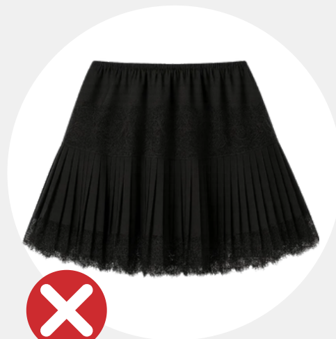
✗ Fashion skirts