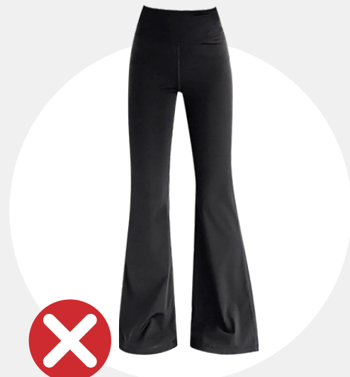
Flares or sportswear