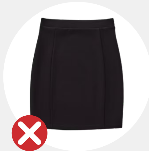
✗ Tube skirts