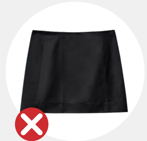
✗ Above the knee