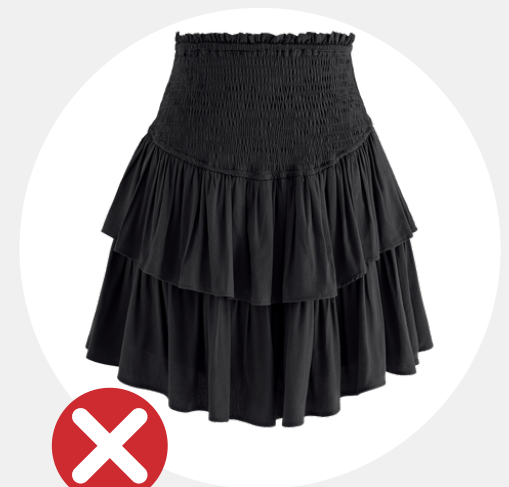
✗ Jersey skirts